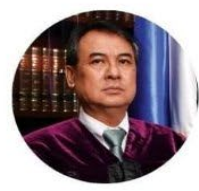
CHIEF JUSTICE ALEXANDER G. GESMUNDO Supreme Court Keynote Speaker